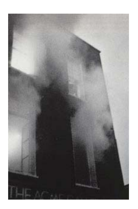
The Acme Gallery, 43 Shelton Street, Covent Garden, London after a Cripps performance. April/May 1978

David Toop Stephen Crippspyrotechnic sculptor-a mongraph published by Acme 1992 (1)