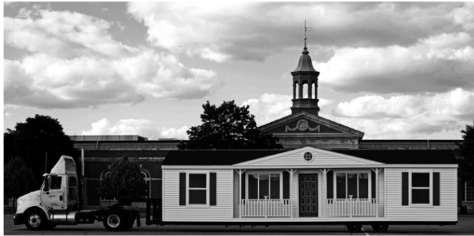
Mike Nelson Low Rise 2013 notebook drawing